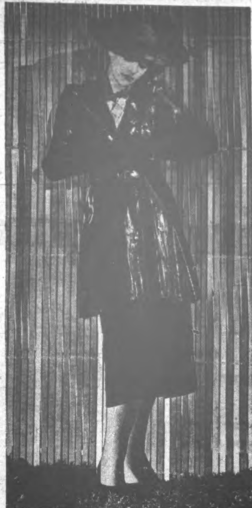
Glistening crepe satin fashions the flaring tunic of this dress by Marcel Rochas. The skirt is wool and a scarf of duck egg blue provides the only note of color to the all-black costume.